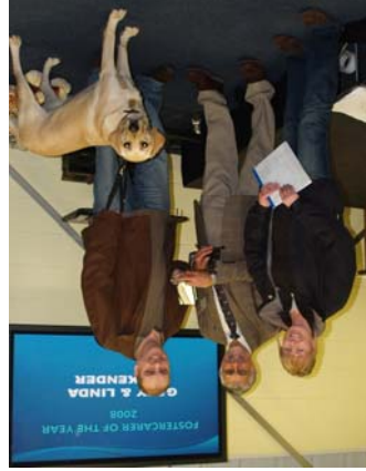
Foster Carers of the Year 2008

Due to the rebuilding of the Training Centre in 2007, this year's AGM was contact us on 0114 261 7800 or by email support-dogs@btconnect.com