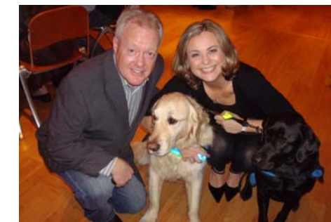
Philippa Forrester & Keith Chegwin meet Ernie & Ajay

The launch of the appeal brought in 653 old phones as Noel encouraged shoppers at Birmingham's Bullring shopping centre to give up their old phones for charity and members of the live studio audience handed in their old sets too.