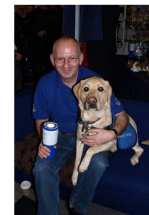
Ray & Baxter on duty at Crufts

In 2010 Support Dogs will once again be appearing at the world's greatest dog show: CRUFTS .