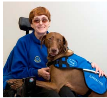
Fundraiser of the Year 2009