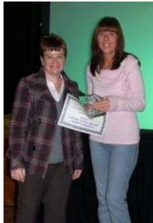
Foster Carer of the Year 2009